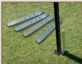
DELUXE STAKE KITS