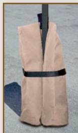
DELUXE WEIGHT BAGS